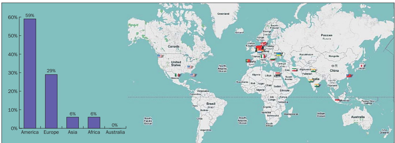
Figure 3. Location of visitors of www.concor.net website. Inset: distribution (in %) of website visitors per continent, the Netherlands excluded. Map with visitors courtesy of Feedjit ( www.feedjit.com ).